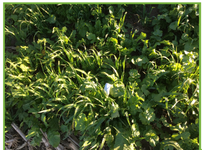
Oats Radish Mix 10 wks growth. Planted Aug 23