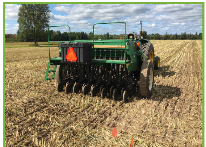
No-Tilling Cover Crops into Sorghum Sudan

Note the number of options and how they greatly diminish as we approach the end of September.